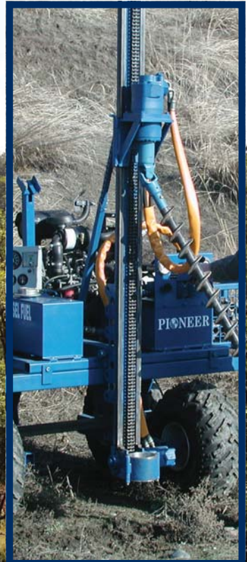
Specialty & Multi-Purpose