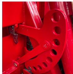
MAST LOCKING Mast mechanically locks at five degree increments (45°-90°) for increased safety and stability.