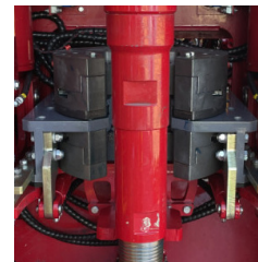
POWER BREAKOUT Hands free power breakout used to safely make and break connections.